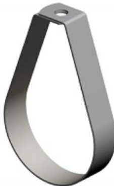
PEAR BRAND FOR PVC PIPE