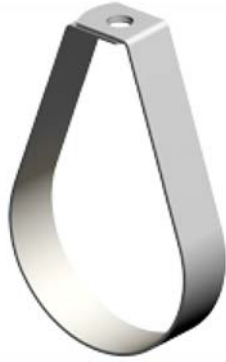
PEAR BRAND FOR STEEL PIPE