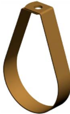
PEAR BRAND FOR COPPER PIPE